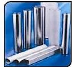
S.S. Seamless Pipe

Introducing as one of the leading Importers, Stockiest & Suppliers for the following Industrial Raw Material in form of Seamless / ERE Pipes, Sheets, Perforated Sheets, Plates, Circles, Rods, Wire, Angles, Wire-Mesh, Flats, Channels etc.