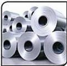
S. S. Coil 0.5 MM to 10 MM