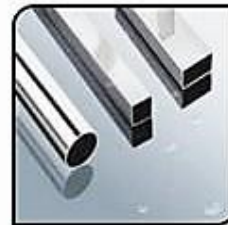
Shape of Pipe