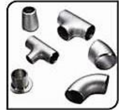
S.S. / M.S. Pipe Fitting