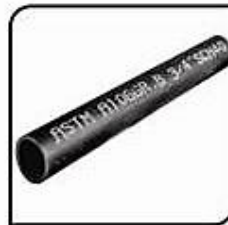
Carbon Steel Pipe