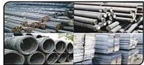
S.S. Round Bar / Square / Wire / Rod / Flat