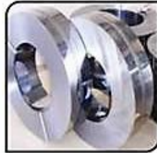
S.S. Strip Coils