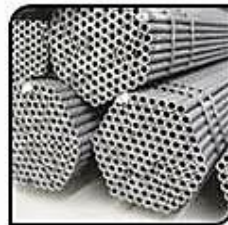
S.S. ERW / Seamless Pipe